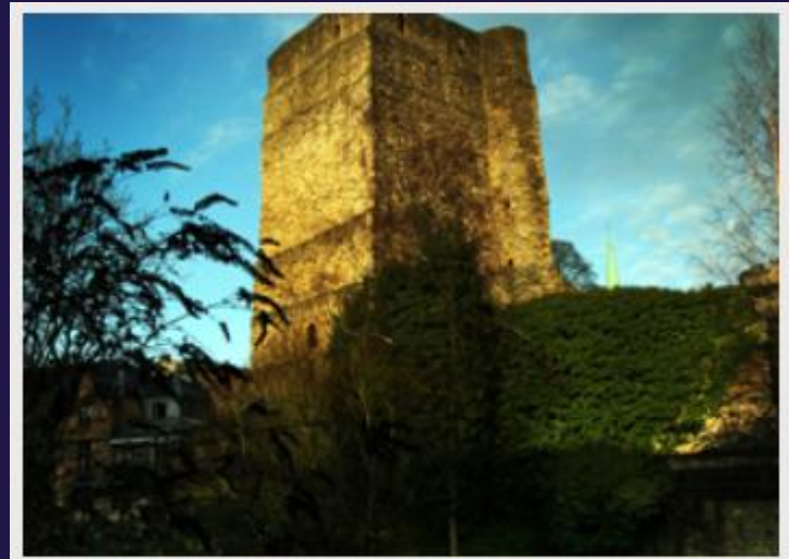
CASTLE CHALLENGE (KS2)